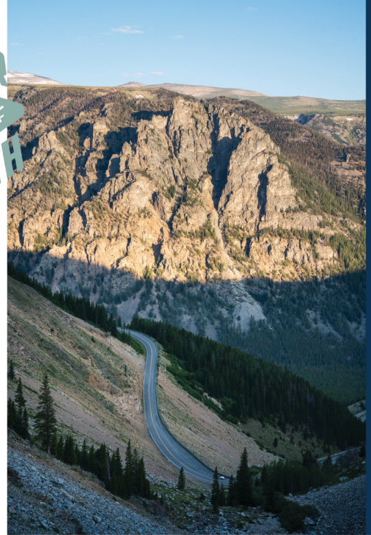
⤴ Beartooth Highway